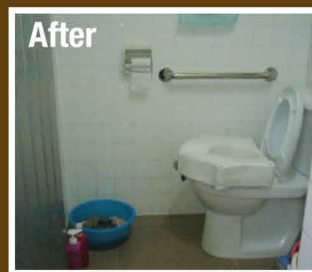
After Sitting toilet with an additional toilet raiser, grab bar and anti-slip floor

"My grandma had a history of repeated falls in the bathroom area. After the home modification, I feel more at ease when my grandma had to be alone at home as she can now move around more safely while using the bathroom."